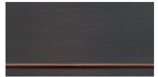
Oil Rubbed Bronze