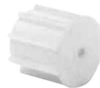
Designer Metals™ Part #73405058